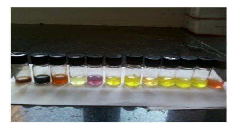
Biochemical reactions of streptococcus