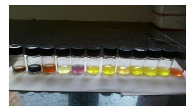
Biochemical reactions of staphylococcus